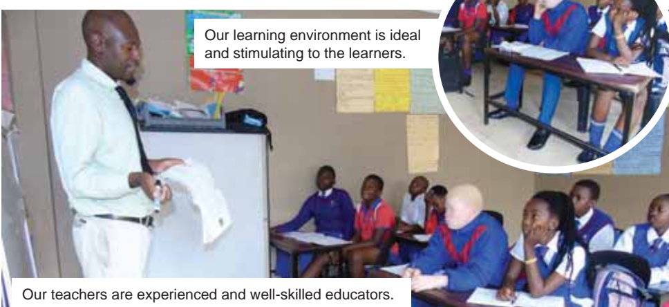
Our learning environment is ideal and stimulating to the learners.

be introducing a new class for Grade 8 in 2020, to add on to the other lower classes that we will continue to offer. There are still a few spaces left for the 2020 academic year and we invite parents and guardians who are concerned about with their children's academic growth to take this journey with us. Make the right choice today and enrol your child at Educare Christian Combined School. Here, excellence in quality education is our passion!