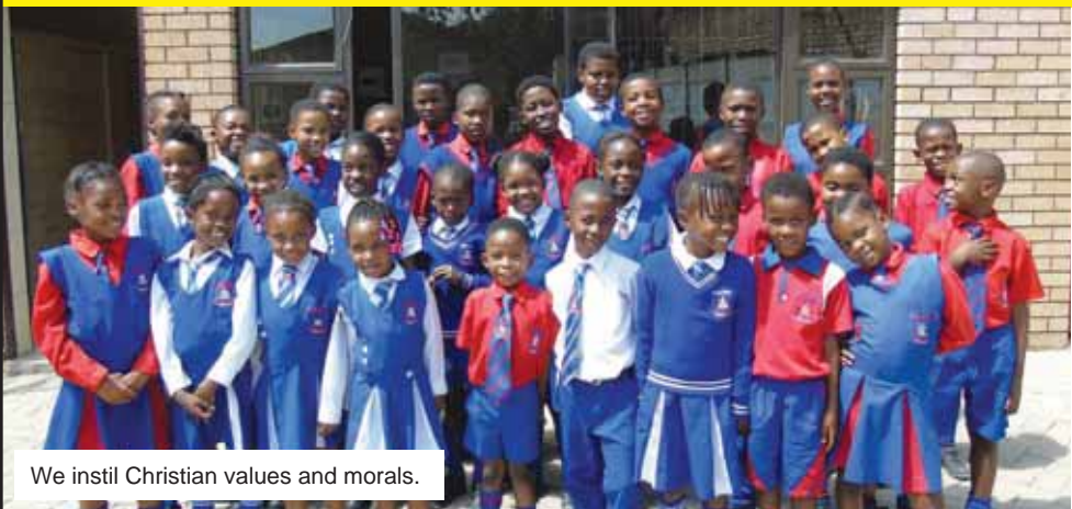
We instil Christian values and morals.

At Educare Christian Combined School, giving children an ideal academic grounding and teaching them the values that will shape them to become responsible and exemplary adults, is what we do best. Educare Christian Combined School offers a safe learning environment that stimulates students to take a keen interest in their academic studies and prepares them to successfully meet the ever-changing demands of modern careers. Situated at 25 Von Wielligh Street in the Rustenburg central business district, our institution is an English-medium school. We