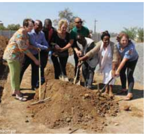
A ground-breaking ceremony!